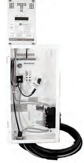
Charge Controller Kit #3: Exterior and Interior Views